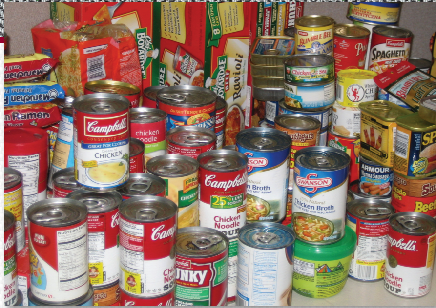
A sampling of the food donated to the Care and Share Food Bank for Southern Colorado.