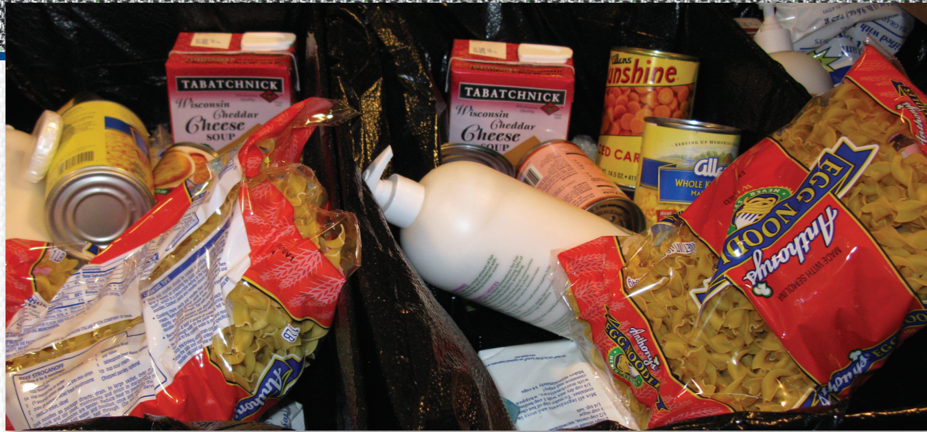
A typical food box distributed to each family every Friday at the Covenant Cupboard.