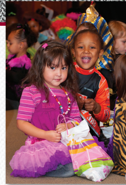
Trick-or-treaters celebrate their loot.

THANKSGIVING FOOD DRIVE We also had a successful food drive again this year just before the Thanksgiving holiday. Working together, our office of only 11 generated more than 30 pounds of food and $375 in cash donations. 2010 was another hard year for the Colorado Springs community, but our efforts helped the Care and Share Food Bank for Southern Colorado to provide more than 2,600 meals for hungry members of our community.