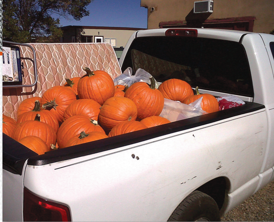
A payload of pumpkins for carving at Casa Esperanza.