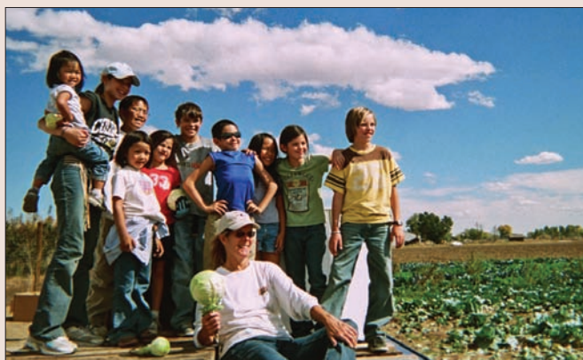
Many children joined their families to pick cabbages for the COMPA Food Bank Ministry.