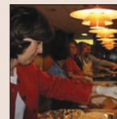
Volunteers served lunch at the Cinco de Mayo fundraiser for Meals-On-Wheels.