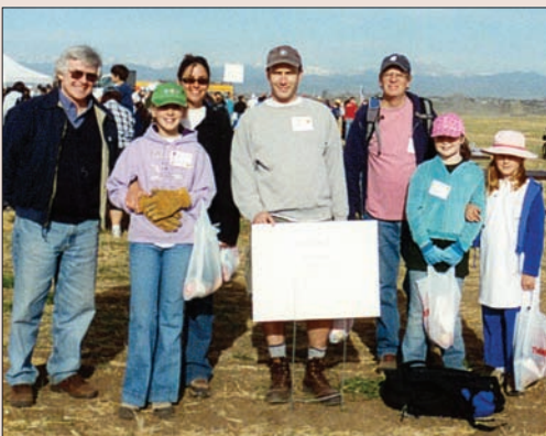
Volunteers planted trees at St. Vrain State Park to celebrate Earth Day.