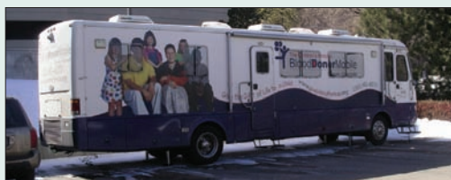
The Children's Hospital Blood Donor Vehicle at the DTC Office