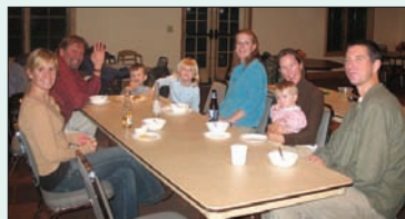
Volunteers enjoyed a delicious meal and great conversation after all of their hard work.