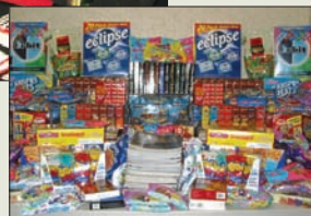
These goodies were purchased and donated to U.S. troops.