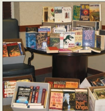
Boise office members collected 13 banker boxes of books for the Women & Children's Alliance Center and the Juvenile Detention Center.