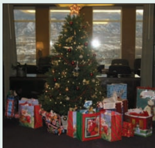
Office members donated holiday gifts for 13 moms and 25 children at TESSA Safehouse